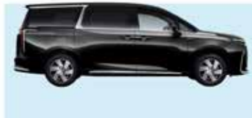
Passenger vehicles →