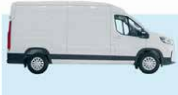
Commercial vehicles →