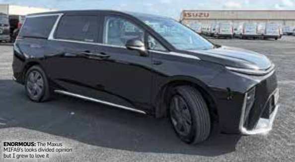
ENORMOUS: The Maxus MIFA9's looks divided opinion but I grew to love it